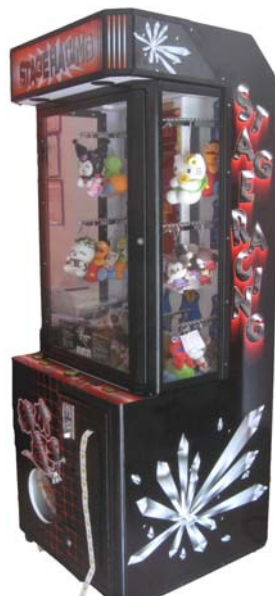
Picture2: Stage Racing(S)